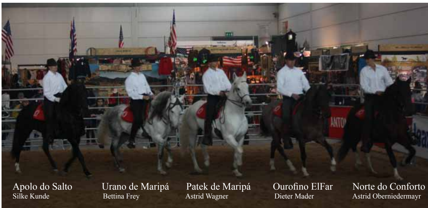
Apolo do Salto Silke Kunde

When we rode outside between the halls we were allways asked by a lot of people what kind of breed the horses are! They got a lot of attention simply by their beauty!